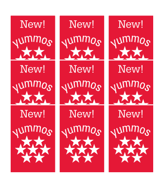
Creating jobs, new products and a manufacturing economy