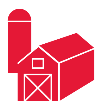
Taking the products of North Carolina's number one industry

College of Agriculture and Life Sciences